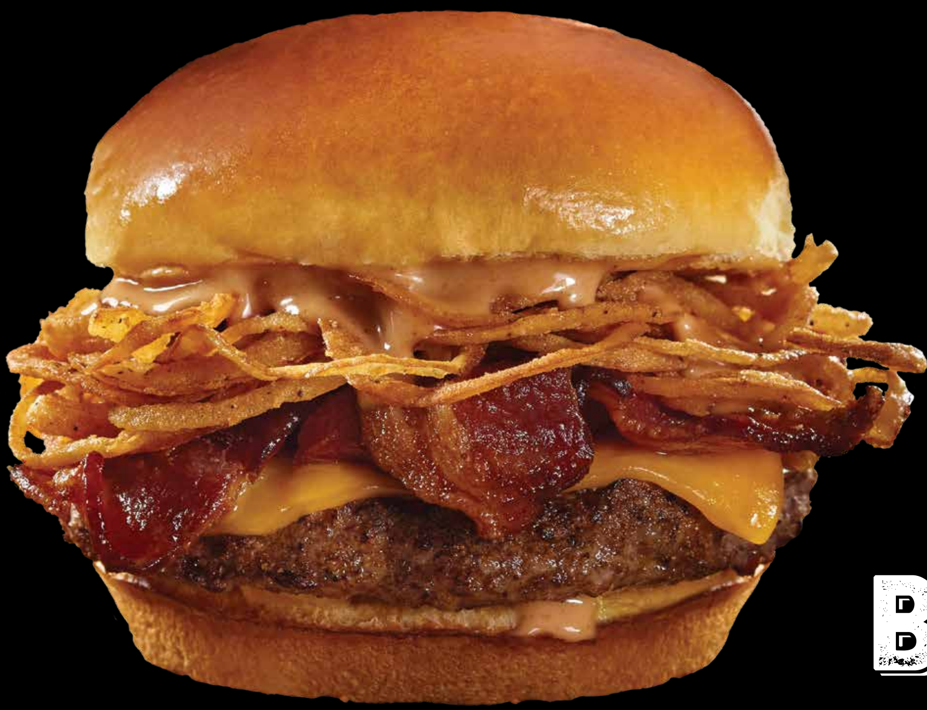
SMOKEY BACON BURGER